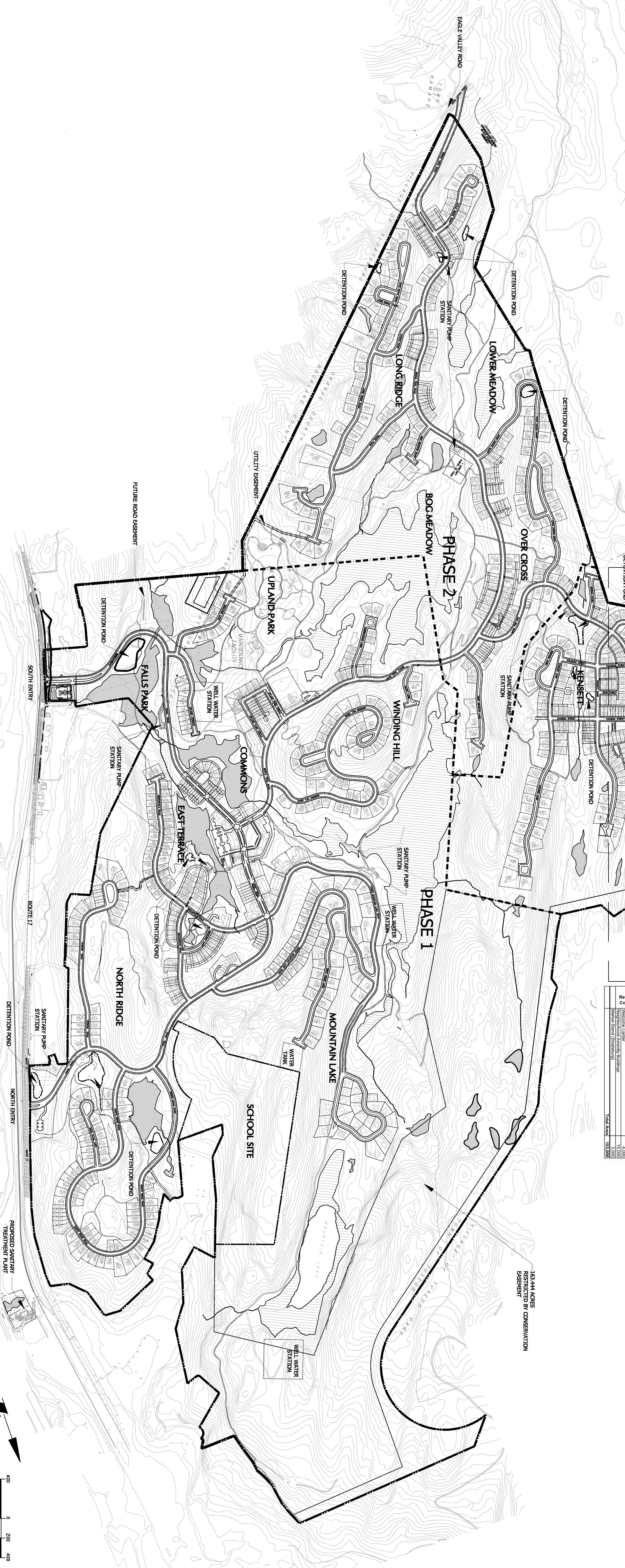
1 Southern Tract Proposed Site Plan SCALE: 1"=400'

NOTE: THE UNIT COUNTS SHOWN IN THIS CHART PREVAIL AS THE PLAN CONFIGURATION OF LOTS MAY BE FURTHER REVISED AT THE TIME OF SUBDIVISION APPLICATION