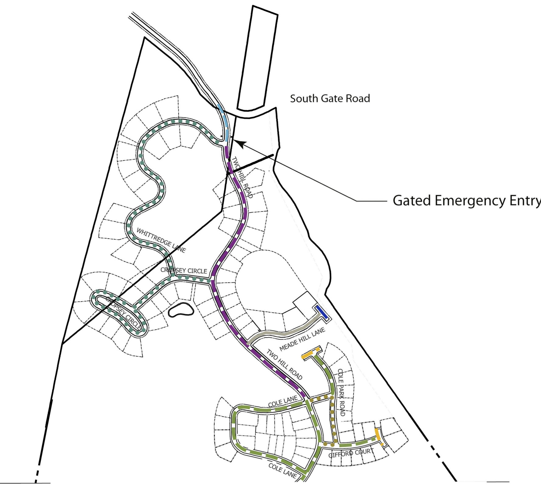
2 Phase 3 With PIPC Parcel SCALE: 1"=400'

PIPC Parcel 2 SEE ALTERNATE PHASE 3 AREA WITH PIPC PARCEL